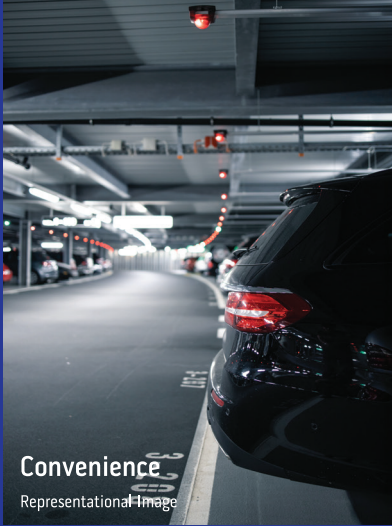
Convenience Representational Image