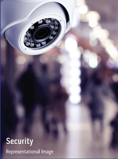
Security Representational Image