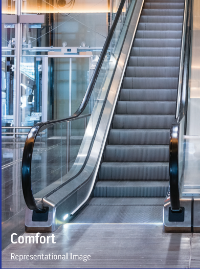
Comfort Representational Image